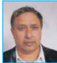
President, Nepal Bar Association